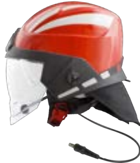
FIRE & RESCUE SOLUTIONS