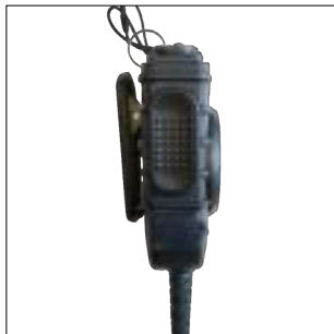
Large side PTT and 3,5mm listen only jack socket