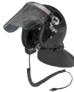
PUBLIC SAFETY SOLUTIONS