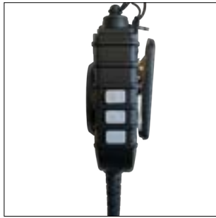
Volume +/- and loudspeaker mute side buttons

With two large Push-To-Talk buttons, enhanced control buttons and IP67 protection rating, the Titan MM50 is the must-have Remote Speaker Microphone for first responders. The Nexus and 3.5mm jack sockets makes headset integration easy and is the ideal solution for users needing to connect helmet audio systems with a portable radio.